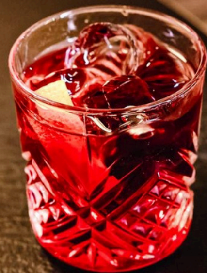
Ruby my dear

Our a la carte cocktails can be customized on request!