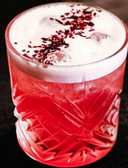
La vie en rose